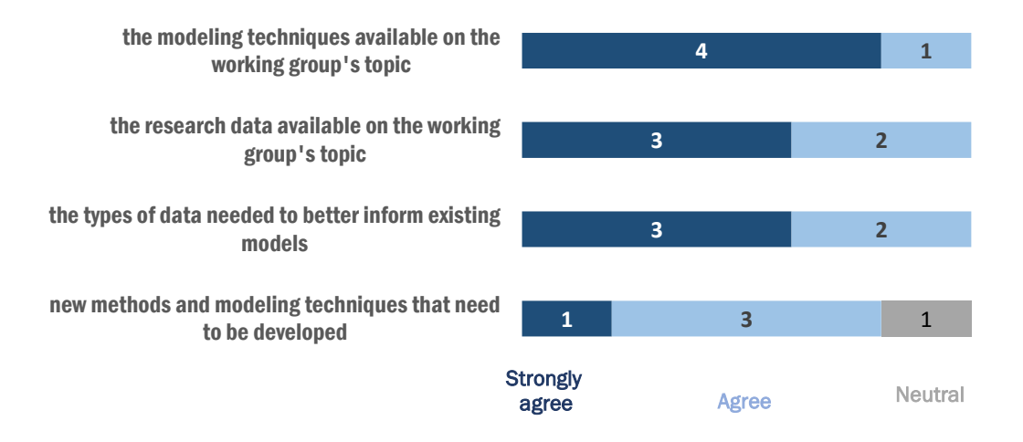
Figure 2. Satisfaction agreement for working group meeting one