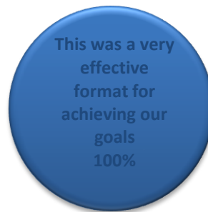
Figure 1. How do you feel about the format of the working group?