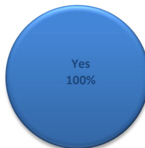
Figure 2. Do you feel the participating in the working group helped you understand the research happening in other disciplines in the group's topic area?