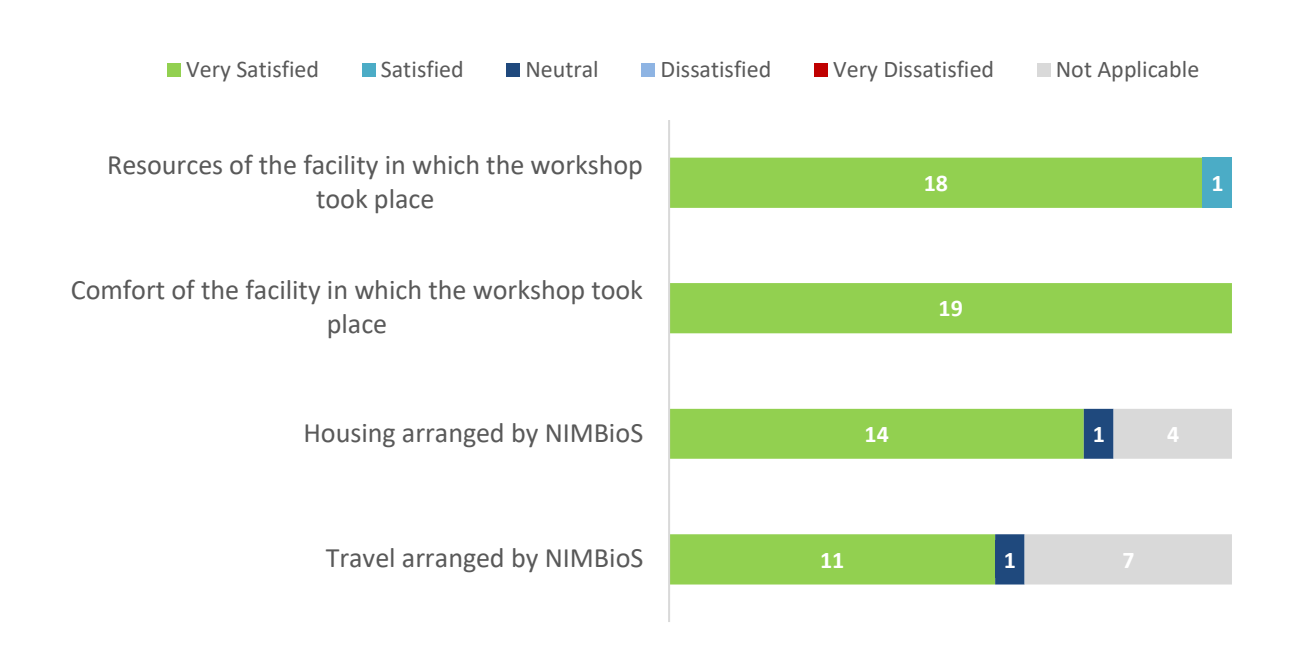
Figure 4. Level of satisfaction with the workshop accommodations: